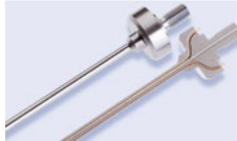
(Fig.1 – Conformal Cooling In Mould Insert)

A major influence in the ongoing success for users of the LaserCUSING® process has been the ability to design and manufacture mould tools and inserts which use conformal cooling principals (Fig.1). The opportunity to cool critical regions of the mould tool frees the users of LaserCUSING® technology from the traditional constraints of tool design.