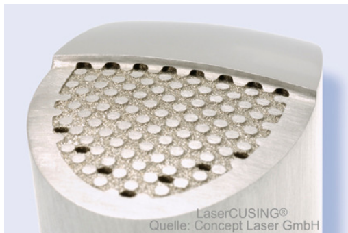
(Fig.2 – Conformal Surface Cooling)

A further example of the competitive advantages made possible with conformally cooled mould tools manufactured using LaserCUSING® is the capability to produce the required volume from fewer tools. In one instance 2 tools incorporating conformal cooling principles were proven to have the capacity to produce the required yearly volume in only a 9 month period. By contrast 3 tools using conventional cooling principles would be required to run for the full 12 month period to achieve the same volume of parts. In this example the conformally cooled tools were capable of achieving double the output per tool.